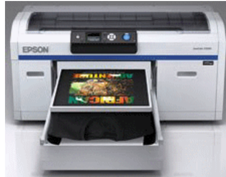
WHITE EDITION (For printing directly onto dark & light colored garments.)