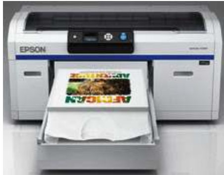
STANDARD EDITION (For printing directly onto light colored garments.)